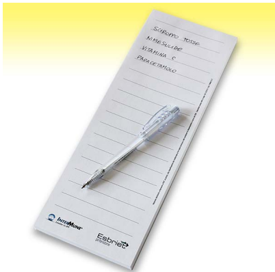
Brogliaccio per farmacia con logo