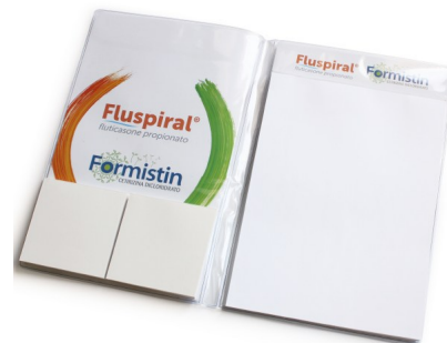
Medical prescription pad A5, clear PVC finishing