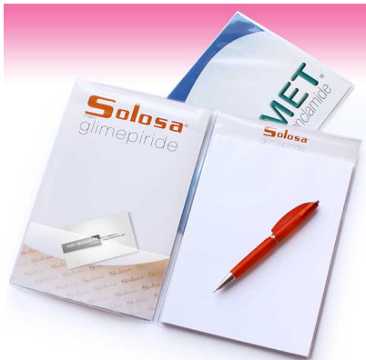
Portaricettario portablocco personalizzato formato A5 finitura trasparente satinata_PVC